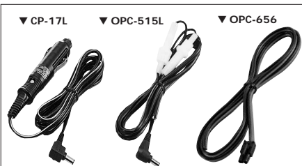
▼ CP-17L ▼ OPC-515L ▼ OPC-656

Made with leather and ensures that the radio stays on your belt.