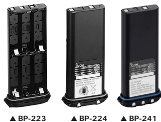
▲ BP-223 ▲ BP-224 ▲ BP-241