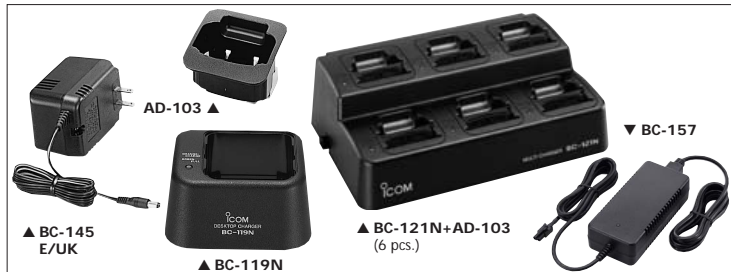
▲ BC-145 E/UK ▲ BC-119N

Regularly charges the battery pack, BP-224 in 8 hours (approx.). Cannot charge BP-241.