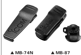
▲ MB-74N ▲ MB-87

MB-68 : Standard flat belt clip. Same as supplied.